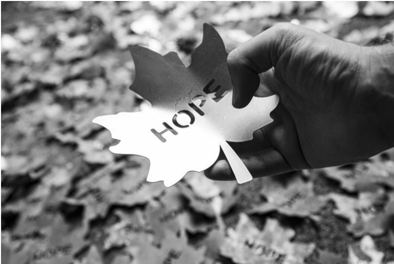
Steel leaf from The Leaves of the Trees, by Peter Walker

Laid across the floor of the church around the Grave of the Unknown Warrior and through the centre of the nave, The Leaves of the Trees installation by sculptor Peter Walker was designed as a reflective memorial to the pandemic. Made up of 5,000 steel leaves with the word HOPE written upon them, it creates a beautiful impression of autumn fallen leaves appearing as though naturally scattered by the wind. The leaves symbolise the past, that which has transpired, and also hope for the future. The shape of a sycamore leaf has been chosen because it symbolises strength, protection, eternity, as well as clarity.