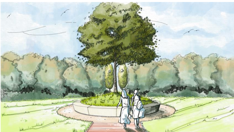
Trees of Life glade: design concept

This new Trees of Life glade is the first step towards the delivery of a vision for a 25-acre extension to the Arboretum, creating a living memorial; a new, natural Remembrance space that will be a place for everyone across the nation to reflect on the service and sacrifice of those who have supported our country during the pandemic, as well as a space where all lives lost can be remembered.