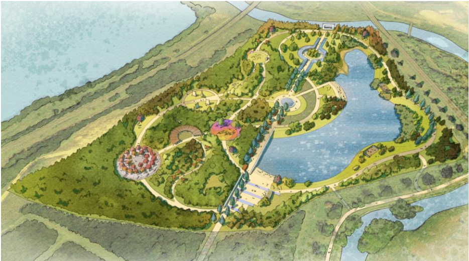
A new living memorial: design sketches

Alternatively, if you would like to be kept up to date with activity and developments at the National Memorial Arboretum, please sign up to our mailing list here: www.thenma.org.uk/about-us/keep-in-touch