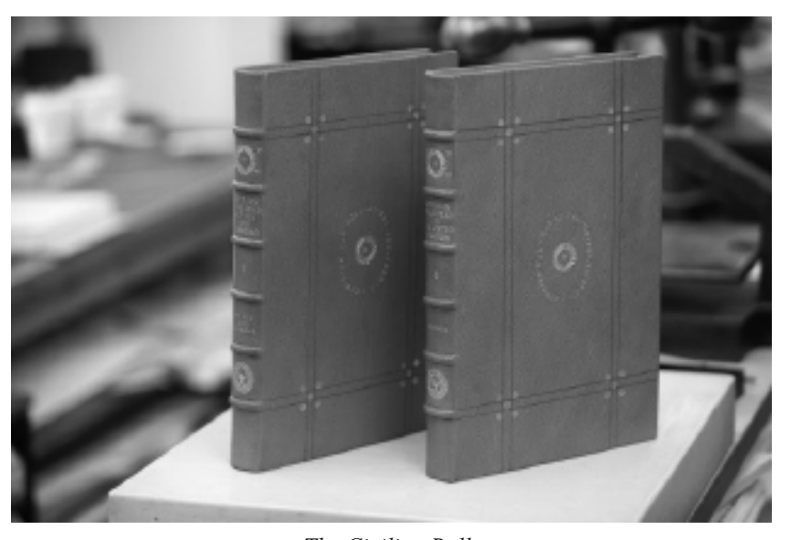
The Civilian Rolls

This proposal was accepted, and the Commission began collecting the names of those civilians killed during the conflict and record them in permanent registers. These registers, once completed, were enrolled in Westminster Abbey where they have been on permanent display ever since.