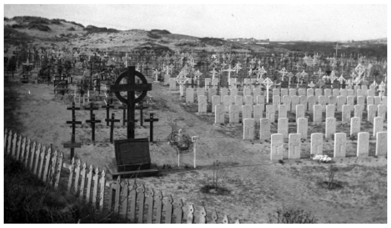
A cemetery in transition: Coxyde Military Cemetery, Belgium, 1922