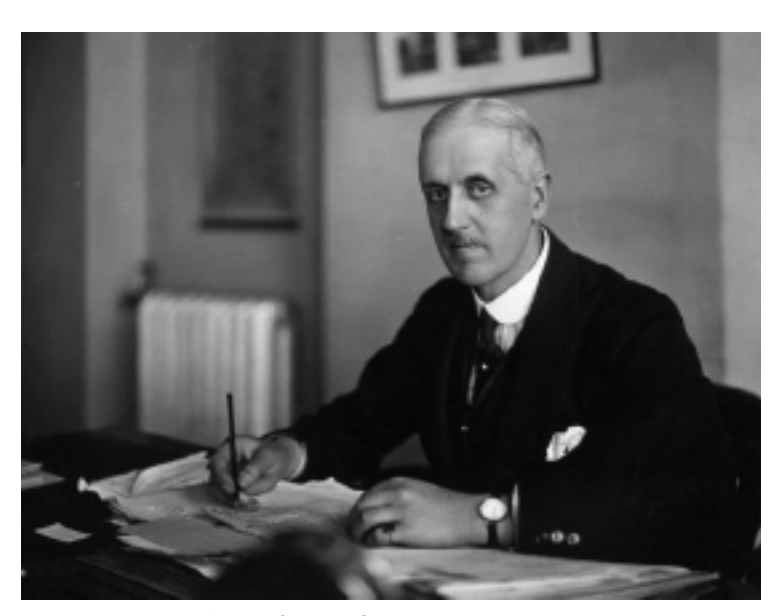
Major General Sir Fabian Ware KCVO CBE CB CMG

1917 was the darkest year of the war for the British Empire. Several costly offensives had failed to break the deadlock on the Western Front. Britain's allies were faltering and German submarines were threatening her vital maritime supply lines. The founding of the Imperial War Graves Commission came at a time when the prospect of victory had never seemed more distant.