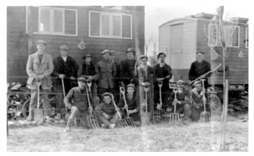
Horticultural staff of the Imperial War Graves Commission (IWGC)

With the process of burial and commemoration now established, Graves Registration Units were organised immediately and land for cemeteries was identified early – sometimes even before battles were fought. A further 600,000 Commonwealth dead were eventually commemorated through the construction of