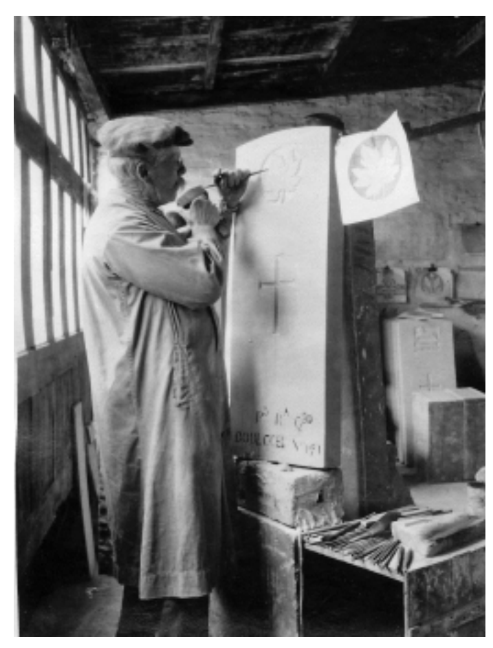
A stonemason in the UK engraves a Canadian headstone destined for a cemetery in northern France