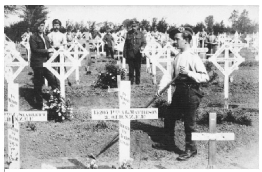
Soldiers tending the graves of their fallen comrades at "Trois Arbres Cemetery", Steenwerck

Once the Commission's proposals began to be formed, there was vociferous debate over the most fitting way to commemorate the dead, and particularly over the tension between individual freedom and collective equality. The principle of nonrepatriation, although emotive, was less than the contentious proposal for a uniform headstone. Thousands signed an unsuccessful petition requesting that