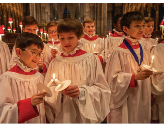
Abbey choristers with Christmas candles.