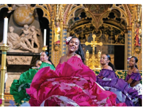
Members of the Tropical Flowers Sega Dancers perform at the Commonwealth Family Day in March.