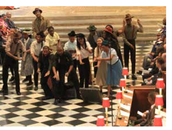
During a Service of Thanksgiving in June to mark the 70th anniversary of the landing of the Windrush a performance of Mixed Welcome depicted the unforeseen realities of life in Britain for new arrivals from the Caribbean.