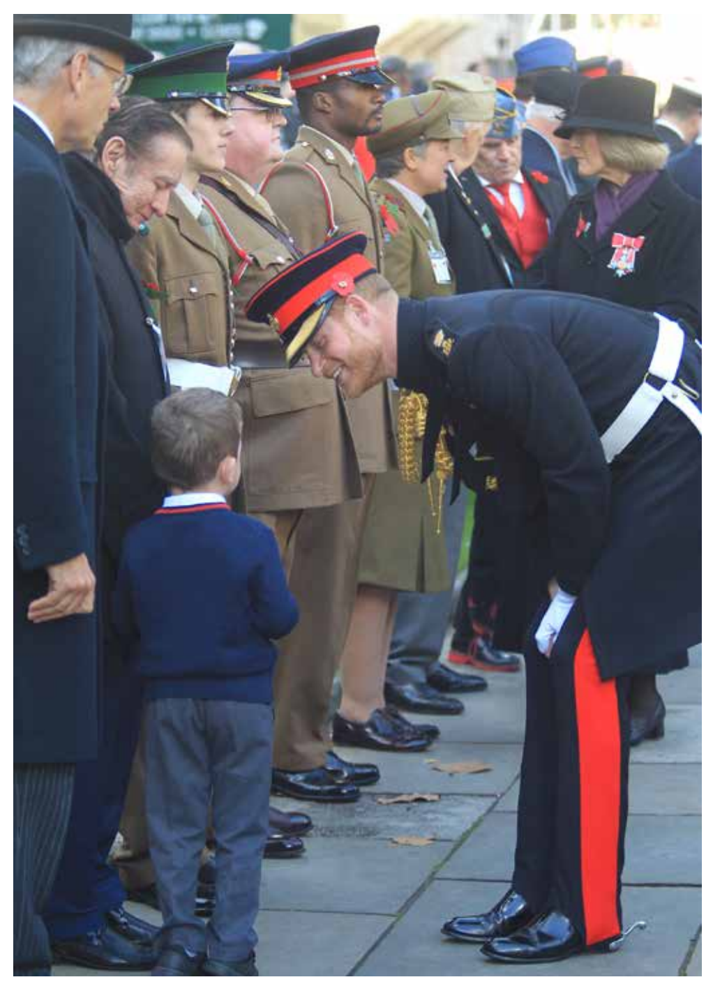
His Royal Highness The Duke of Sussex greets a young visitor at the Opening of the Field of Remembrance in November.

St Margaret's and Westminster Abbey Institute seek always to promote the Abbey's mission with a particular focus on the aspiration to serve the nation by fostering the place of true religion within national life, maintaining a close relationship with members of the House of Commons and House of Lords and with others in representative positions.