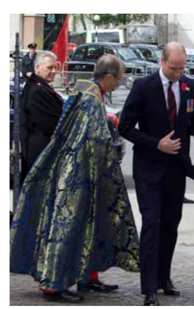
His Royal Highness The Duke of Cambridge and Their Royal Highnesses The Duke and Duchess of Sussex arrive at the Abbey's west gate for the ANZAC service in April.