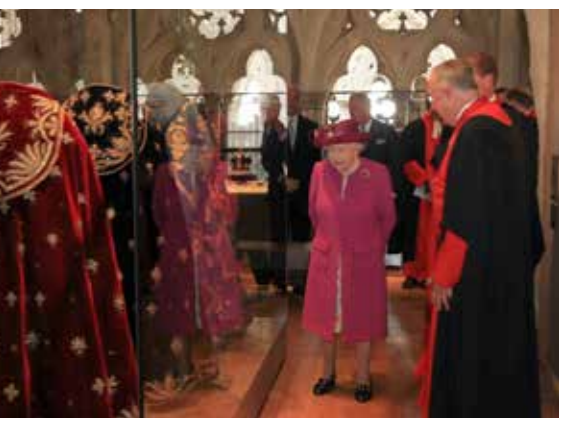
Her Majesty The Queen inspects part of the Abbey's collection of vestments during a visit to open the new Queen's Diamond Jubilee Galleries in June.