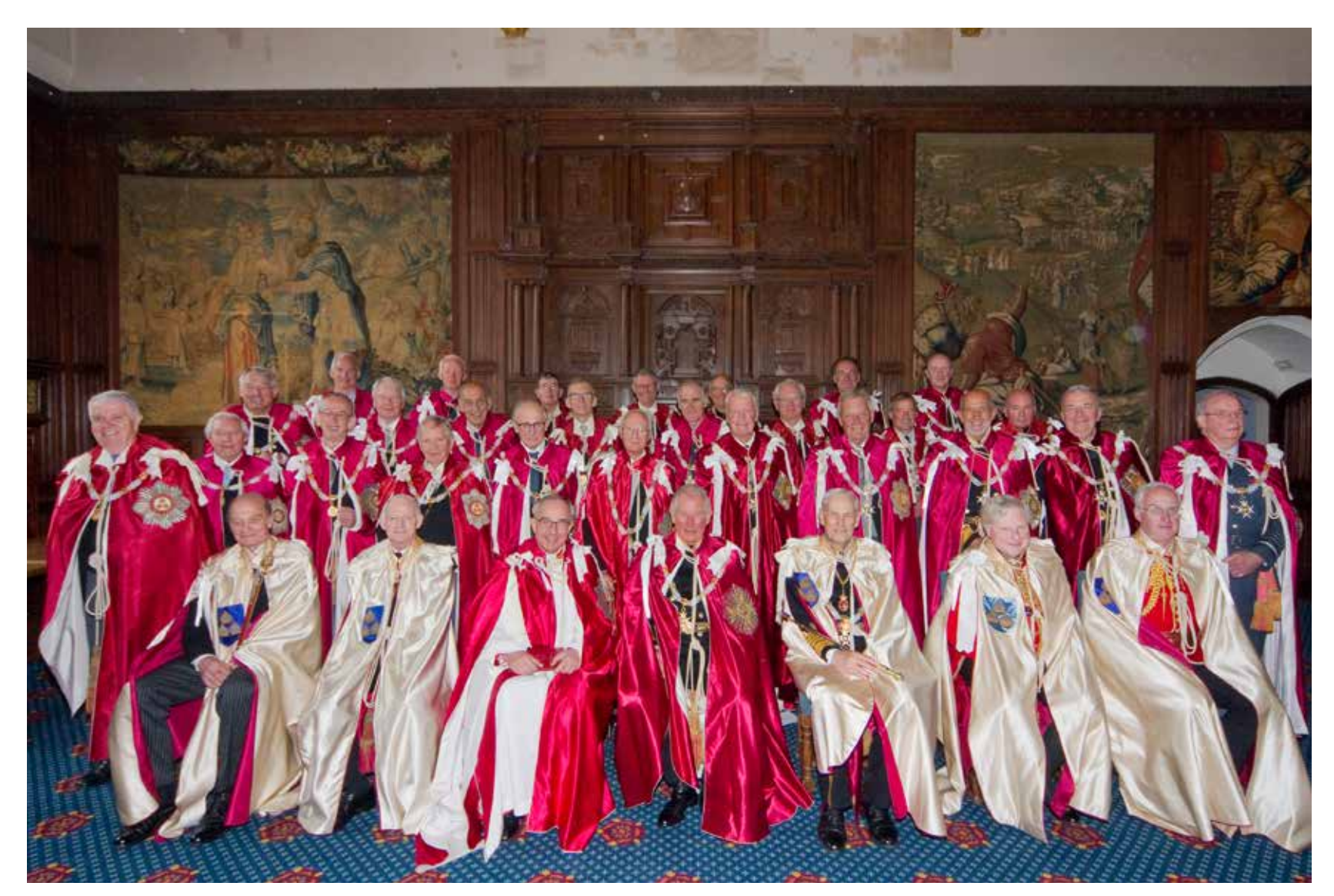
His Royal Highness The Prince of Wales, Great Master of the Most Honourable Order of the Bath, with officers and members at the Order's quadrennial service in May