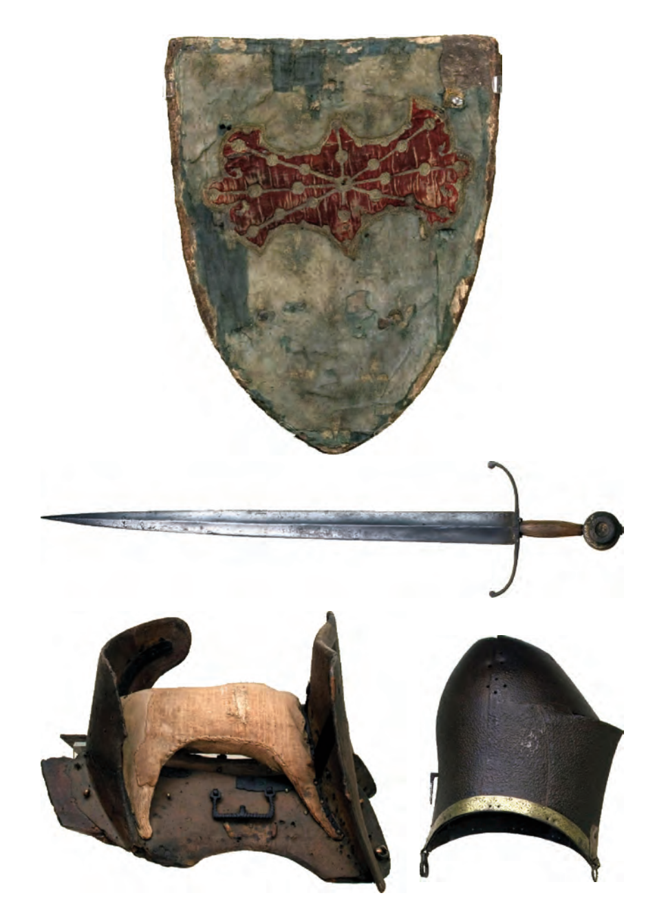
Above: The achievements of King Henry V—his shield, sword, saddle and helm—used at his funeral in Westminster Abbey on 7<sup>th</sup> November 1422