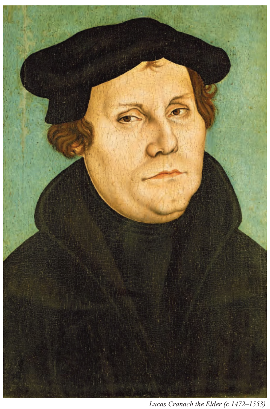
Lucas Cranach the Elder (c 1472–1553) Wittenberg, 1528