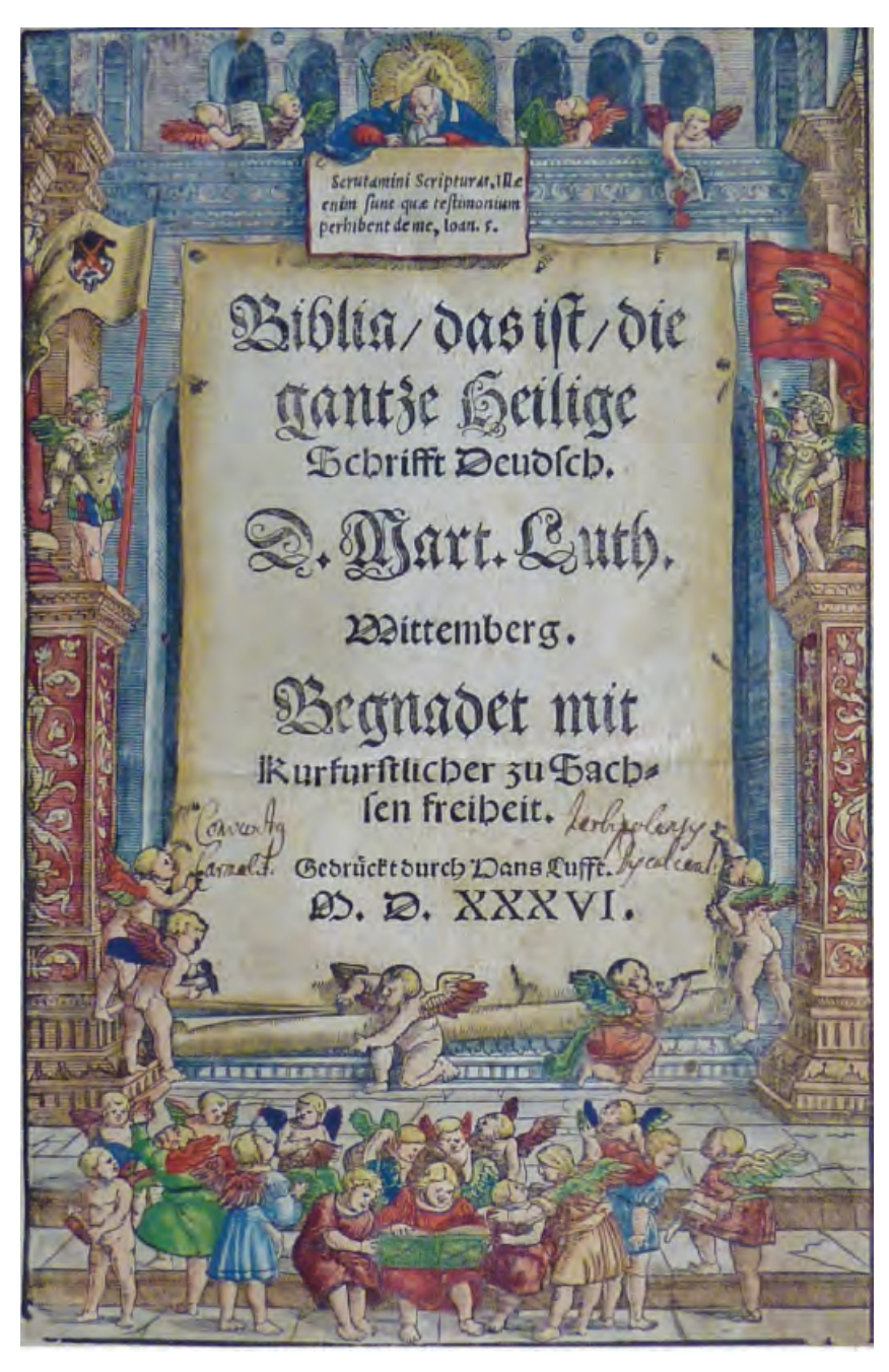
Biblia, das ist, die gantze Heilige Schrifft Deudsch (Wittenberg: Hans Lufft, 1536) Lambeth Palace Library (Sion College collection) A13.6/L97