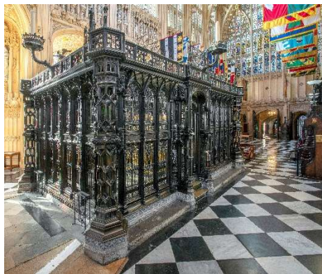
Tomb of Henry VII