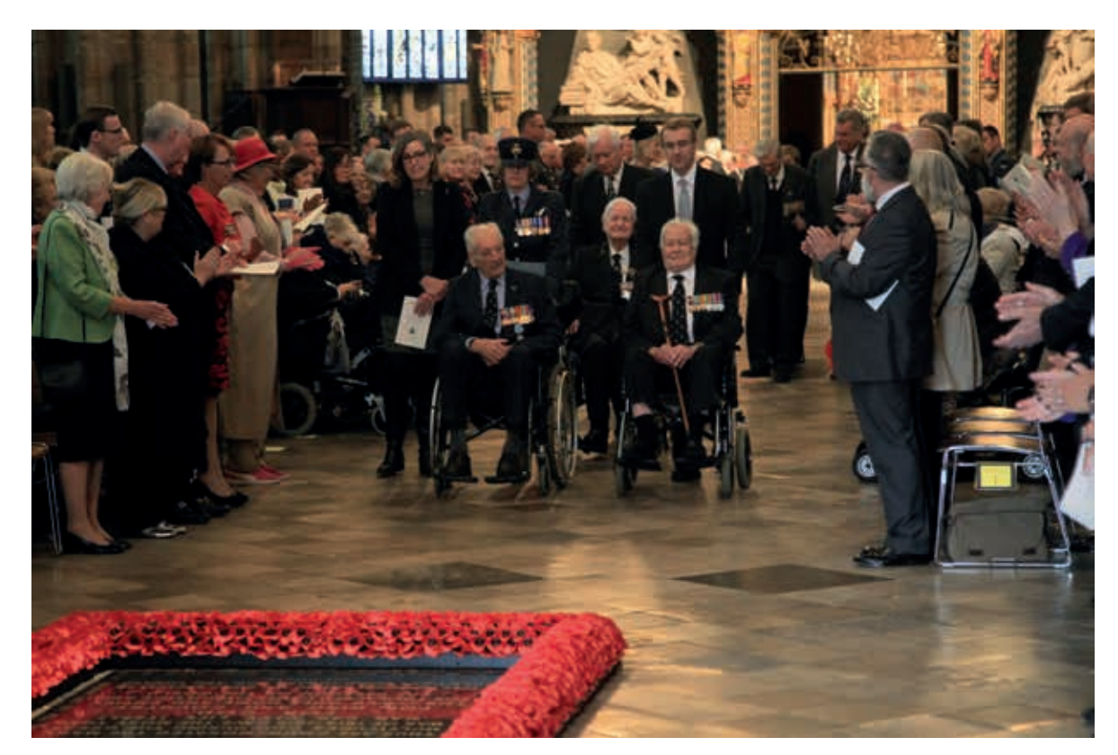
Second World War fighter pilots receive a standing ovation from the congregation in the nave at the end of the Battle of Britain service in September.

As a Chapter we intentionally nurture this amongst ourselves in regular times of theological reflection. These are opportunities to review all aspects of Abbey life specifically through a theological lens. And, where necessary, to think afresh in the light of that theological imperative.