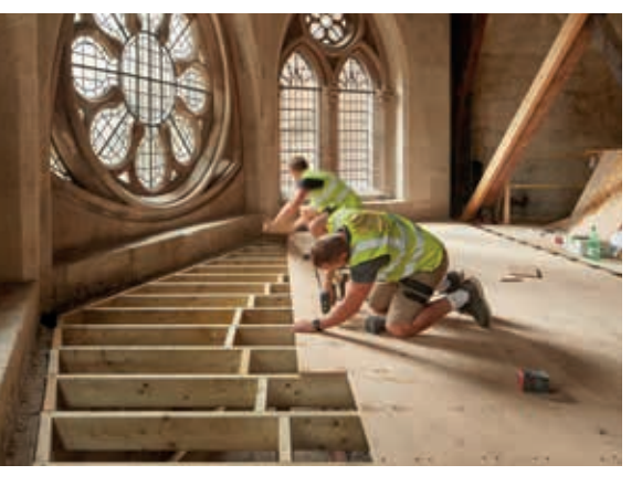
Throughout the year work has continued to transform the Abbey's medieval triforium into The Queen's Diamond Jubilee Galleries which will open in June 2018.