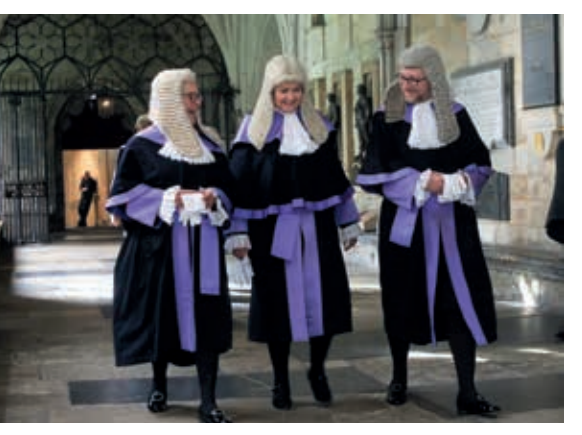
Three circuit judges in the west cloister before the annual Judges Service in October