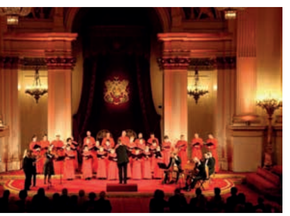
The Abbey Choir sang at a gala dinner hosted by His Royal Highness The Prince of Wales at Buckingham Palace to thank donors who have supported the development of the Queen's Diamond Jubilee Galleries.