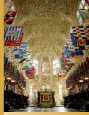
Henry VII completes the nave and builds the awe-inspiring Lady Chapel.