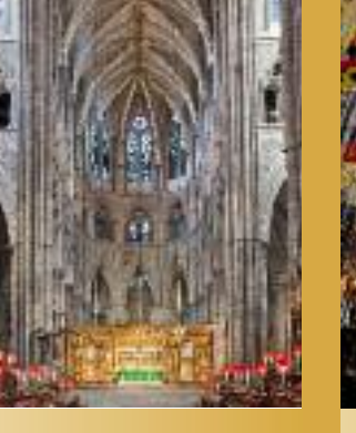
Henry III begins to rebuild the Abbey in 1245.