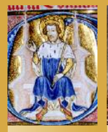
St Edward the Confessor refounds the 10th century monastery of St Dunstan in 1065.

Legacies and vision. These are what have provided the foundations for the Abbey's development over the centuries. From St Dunstan's establishment of a Benedictine monastery here in the 10th century to our 21st century additions of an education centre (opened in May 2010 by HM The Queen), a first ever restaurant for visitors (2012) and the conversion of the triforium level of the Abbey into new gallery and exhibition space (2018), the Abbey's development as a place of worship and wonder for all never stops.