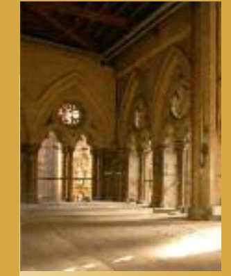
21st Century additions of an education centre, a restaurant and Queen's Diamond Jubilee Galleries.