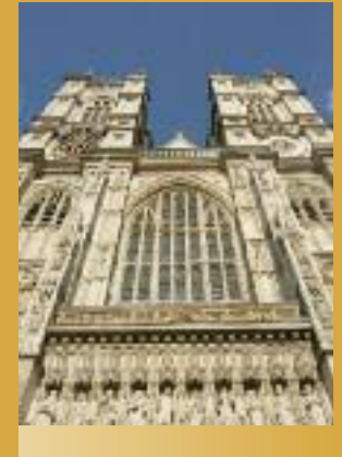
Nicholas Hawksmoor's West Towers are completed in 1745.