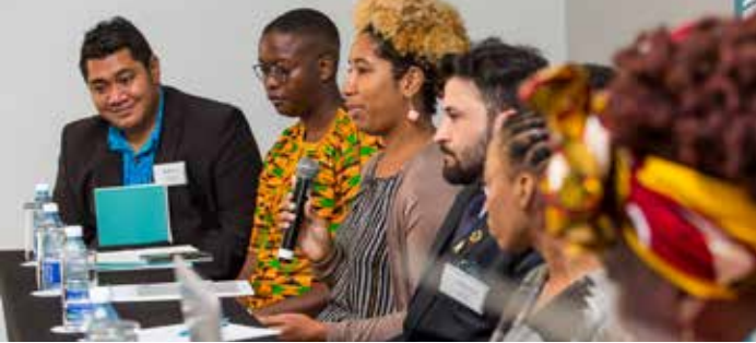
A MORE EQUAL COMMONWEALTH Our goal is a Commonwealth where all people are treated equally within their communities and before the law, regardless of their sex, gender, sexual orientation, gender identity or other status.