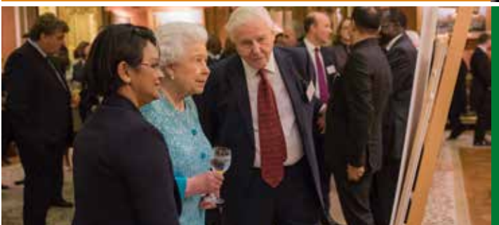
PROTECTING THE ENVIRONMENT Through initiatives such as The Queen's Commonwealth Canopy, we work to protect one of the world's most important natural habitats - our forests. Since 2015, over 3,495,000 hectares have been protected for future generations.