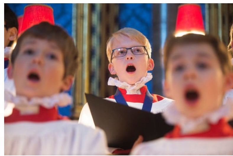
Choristers in 1685