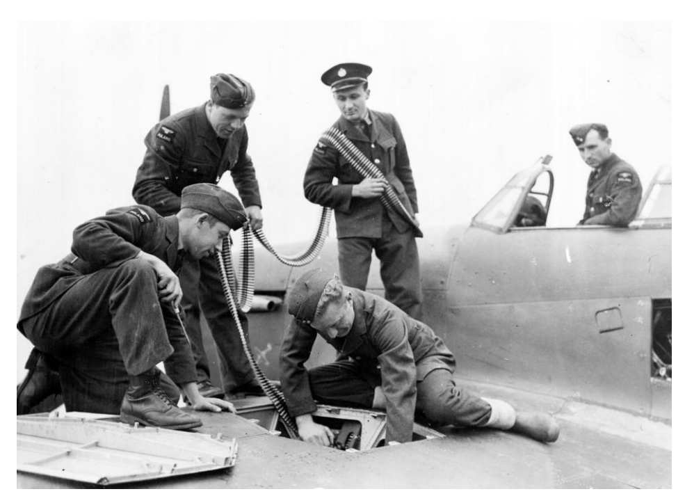
Armourers replenish the guns of Hawker Hurricane I of 303 (Polish) Squadron at Leconfield, Yorkshire, 24th October 1940.