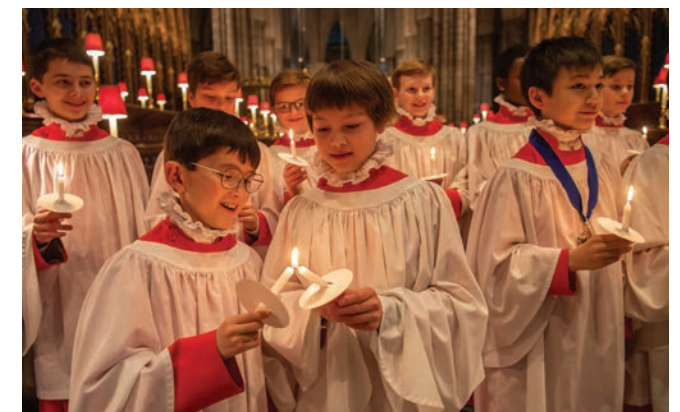
Abbey choristers with Christmas candles.