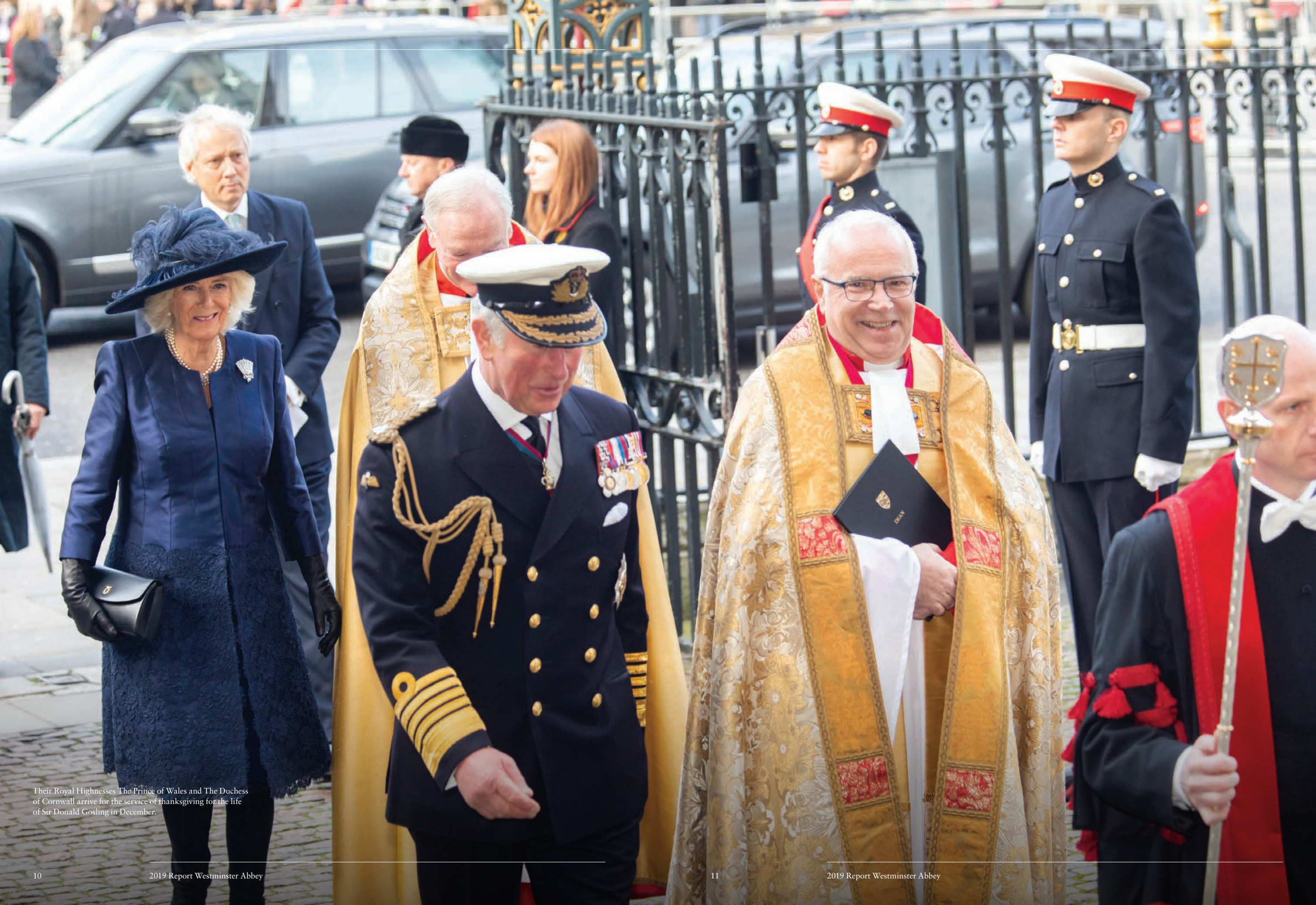
Their Royal Highnesses The Prince of Wales and The Duchess of Cornwall arrive for the service of thanksgiving for the life of Sir Donald Gosling in December.