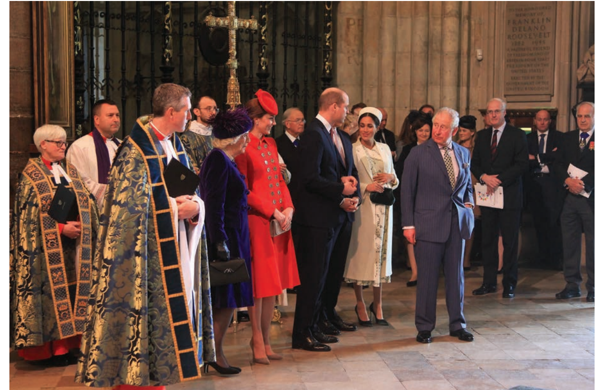
Members of the Royal Family wait for the arrival of HM The Queen at the start of the Commonwealth Service: Minor Canon and Sacrist the Reverend Mark Birch; HRH The Duchess of Cornwall, HRH The Duchess of Cambridge, HRH The Duke of Cambridge, HRH The Duke of Sussex, HRH The Duchess of Sussex, and HRH The Prince of Wales.

We have implemented a cyclical maintenance and review programme to mitigate the possibility of a major fabric failure and are currently installing a facility to ensure an uninterrupted power supply. We have also carried out a fire risk review to help identify the potential for further fire prevention initiatives.