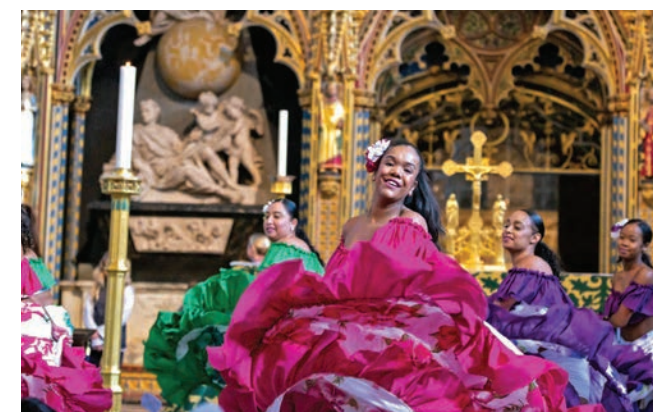
Members of the Tropical Flowers Segha Dancers perform at the Commonwealth Family Day in March.