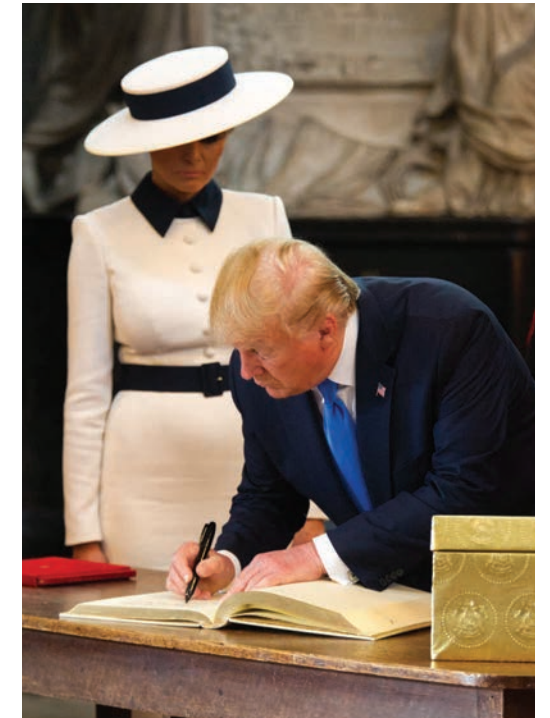
The President of the United States of America, Donald Trump, accompanied by the First Lady, Mrs Melania Trump, signs the Distinguished Visitors' Book during a State Visit in June.