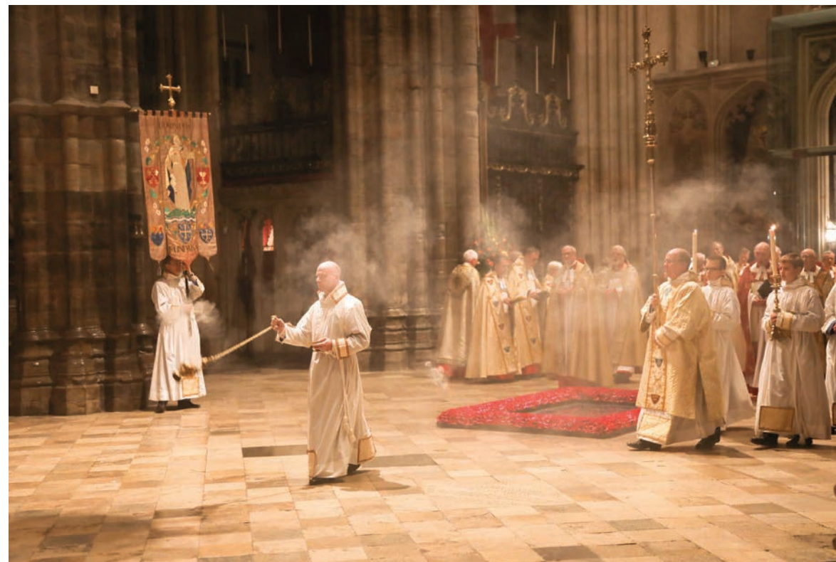
Incense fills the nave of the Abbey at the start of a service of Eucharist to mark All Saints' Day in November.

Under the oversight of the Canon Steward & Almoner, the Dean and Chapter aims to distribute relevant unrestricted collections and donations received during the course of the year, along with 10 per cent of its unrestricted operational surplus before investment gains. The combined value of these items was £385,000 in the year, of which £228,000 was approved for payment by the Dean and Chapter (2018: £396,000). The balance of designated funds for charitable giving available for future distribution at the end of the financial year was £200,000. A further £50,000 was paid to charities from restricted funds.