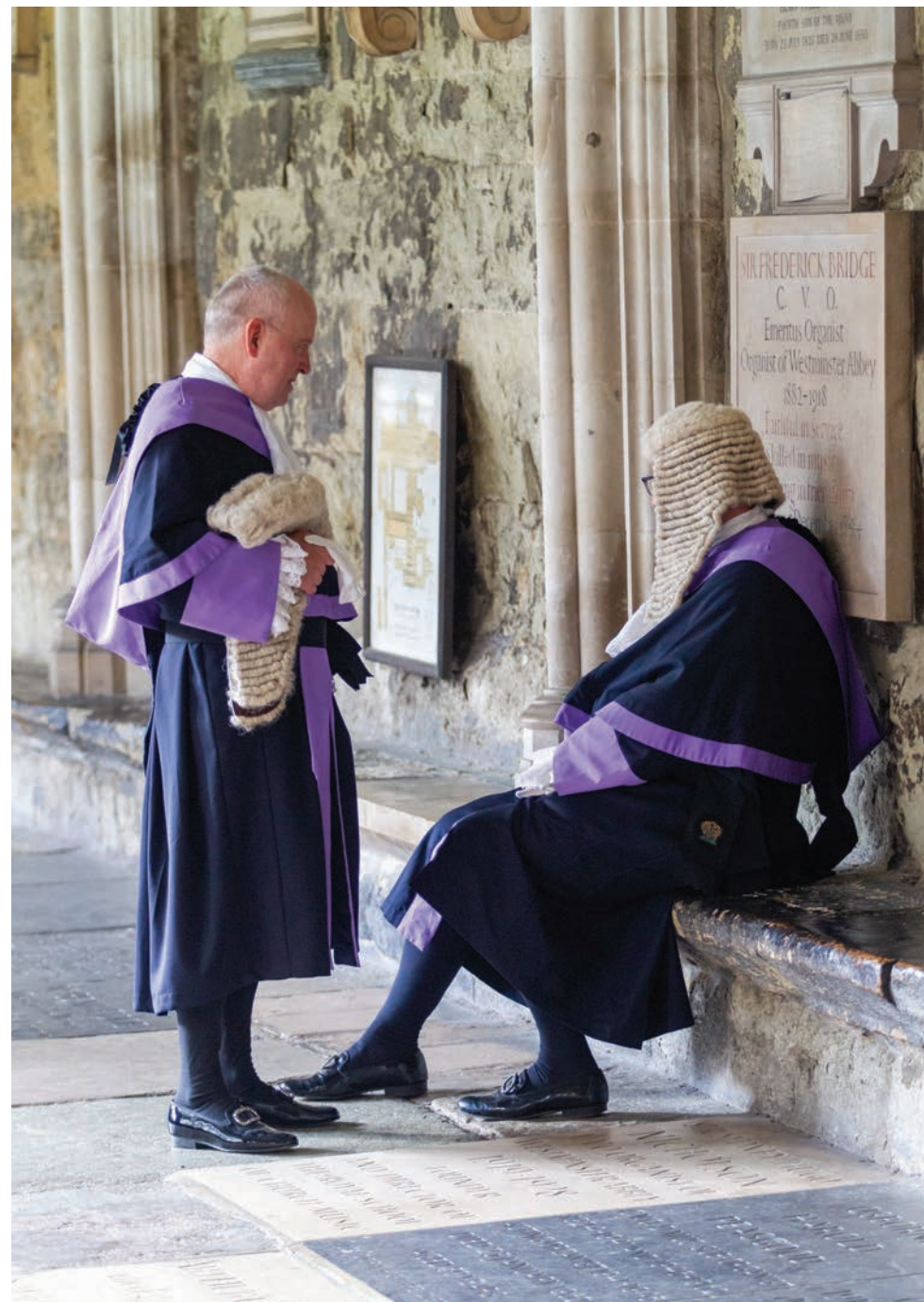
Two circuit judges gather their thoughts in the Abbey's west cloister before the annual Judges' Service in October.

In April 2019 and to celebrate Shakespeare's birthday, the Abbey hosted Mark Rylance and Shakespeare's Globe (including Intermission Youth Theatre) over three consecutive nights staging immersive theatre performances of Shakespeare within the Abbey: All places that the eye of heaven visits . In August 2019, in partnership with the open-air theatre company, Illyria, the Abbey hosted The Tempest over two nights, and in partnership with Luna Cinema, the Abbey screened three films in Dean's Yard. Audience numbers for these events exceeded 5000, including many first-time visitors to the Abbey.