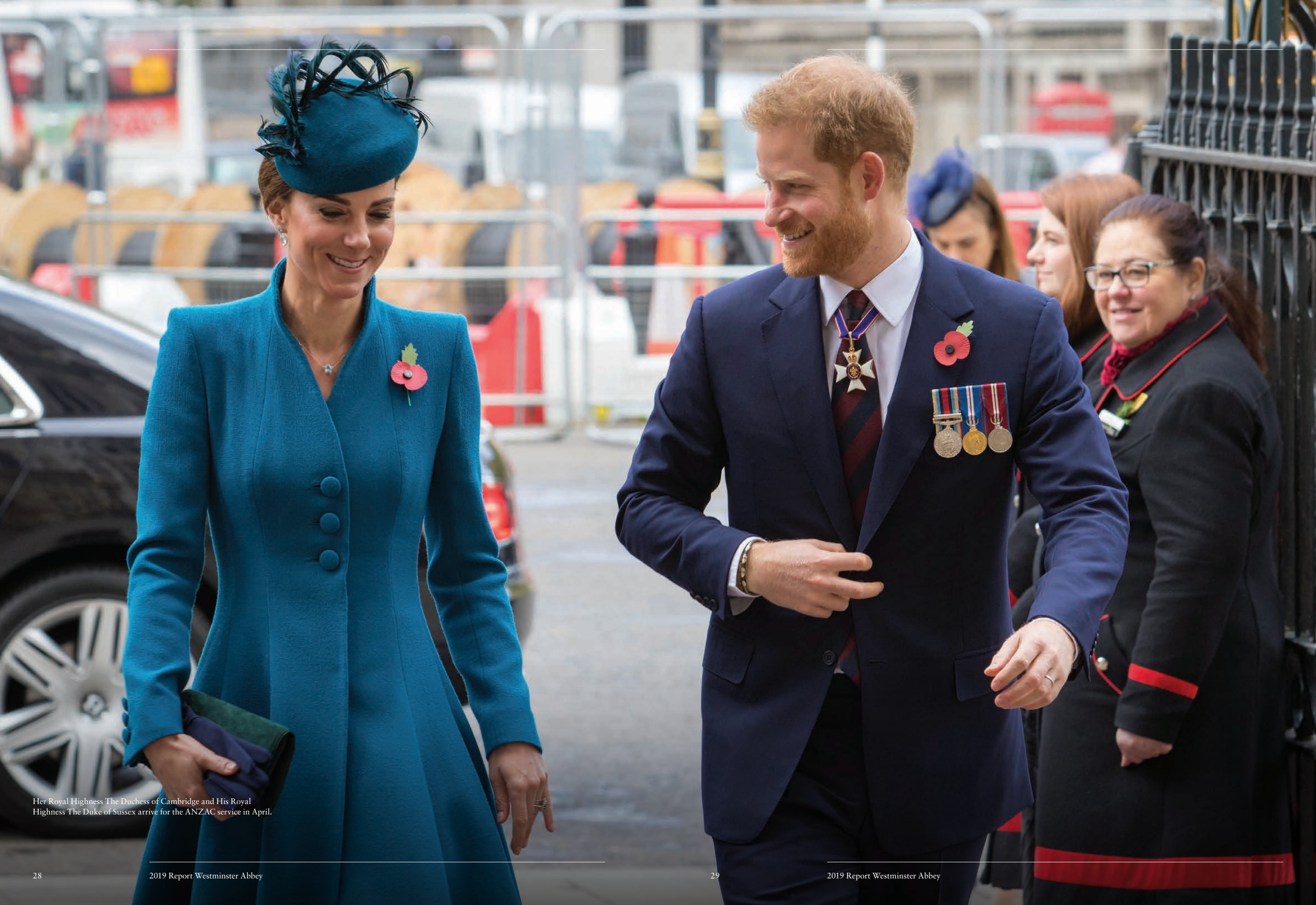
Her Royal Highness The Duchess of Cambridge and His Royal Highness The Duke of Sussex arrive for the ANZAC service in April.