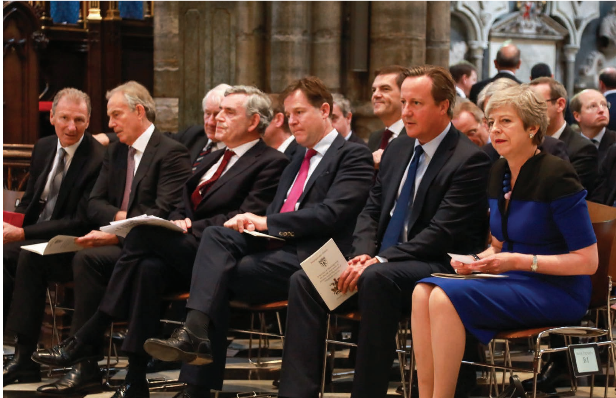
Former Cabinet Secretary, Lord O'Donnell (left), with former Prime Ministers Tony Blair and Gordon Brown, former deputy Prime Minister Sir Nick Clegg, another former Prime Minister, David Cameron, and serving Prime Minister Theresa May at a service of thanksgiving for the life of Cabinet Secretary, Lord Heywood, in June.