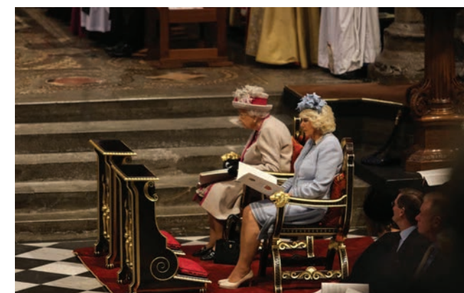
Her Majesty The Queen and Her Royal Highness The Duchess of Cornwall at a service to mark the 750th anniversary of Henry III's church