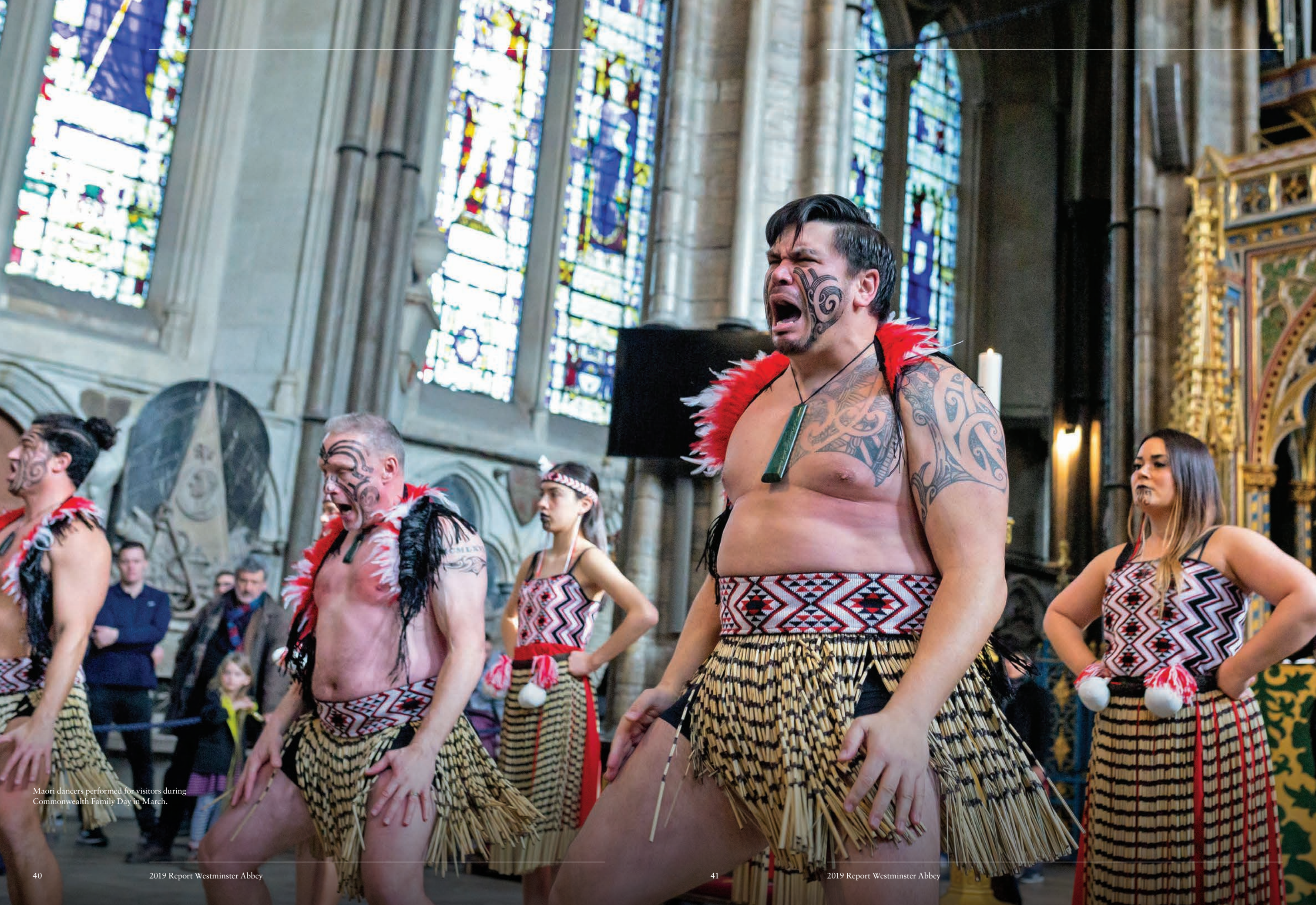
Maori dancers performed for visitors during Commonwealth Family Day in March.