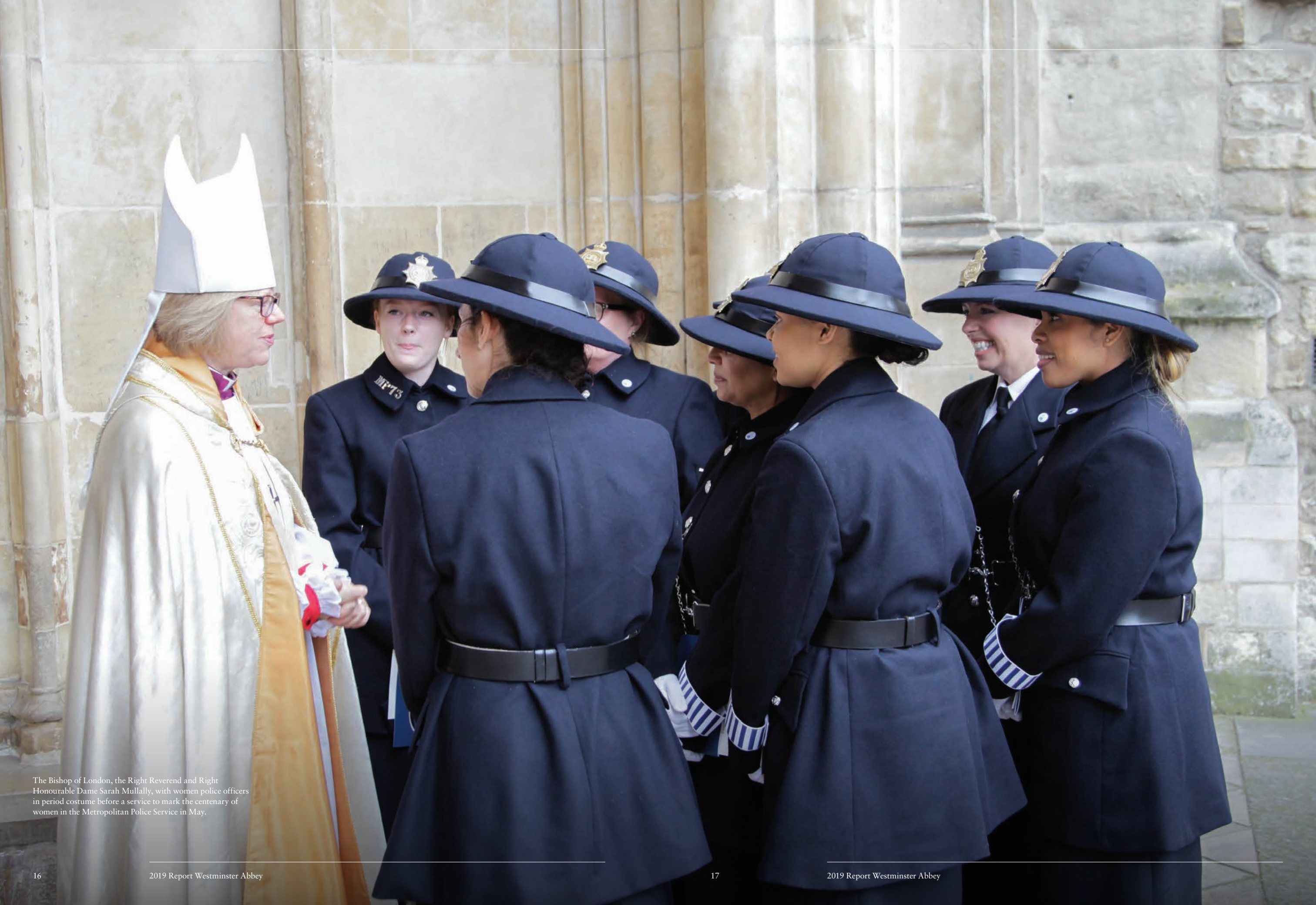
The Bishop of London, the Right Reverend and Right Honourable Dame Sarah Mullally, with women police officers in period costume before a service to mark the centenary of women in the Metropolitan Police Service in May.