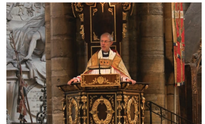
The Archbishop of Canterbury, the Right Honourable and Most Reverend Justin Welby, preaches at the Edwardtide Pilgrimage in October.